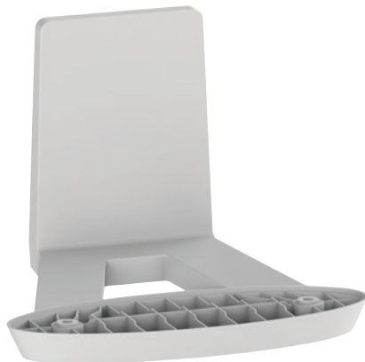
Wall mount cover